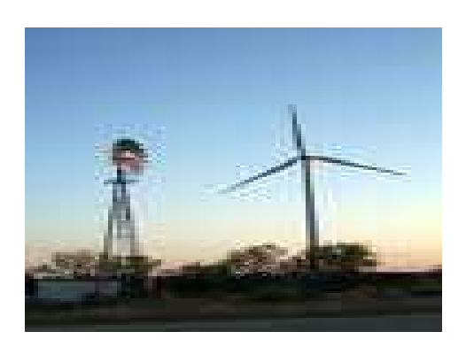
Fig. 2 showing a wind mill utilising wind as a renewable resource

3. Perpetual resources : These are resources that are of continued supply in the environment; their quantity is not affected by human consumption; examples of resources in this category include sunlight, air, etc.