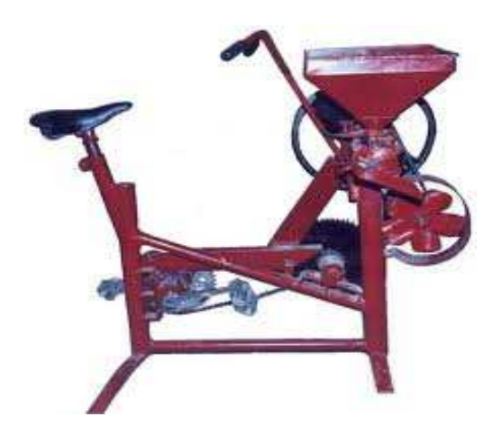
Fig. 1 An example of intermediate technology: Gym bicycle which also doubles as grinding machine

However, the use of intermediate or appropriate technology should not mean that developing countries are abandoning modern technology which is still the cheapest and most efficient way of producing large quantity of good quality products demanded by the market. Modern technology must and will continue, and it cannot be replaced by appropriate technology. Intermediate technology is a complement to modern technology, and both should exist side by side in the same society.